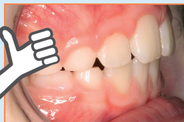
After 1 year *